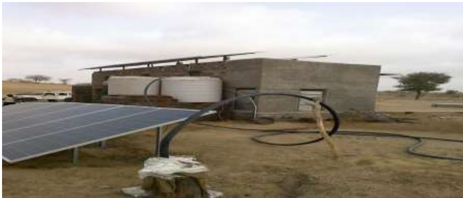
Solar Powered RO Water Plant at Bhurjgarh (Jaisalmer)