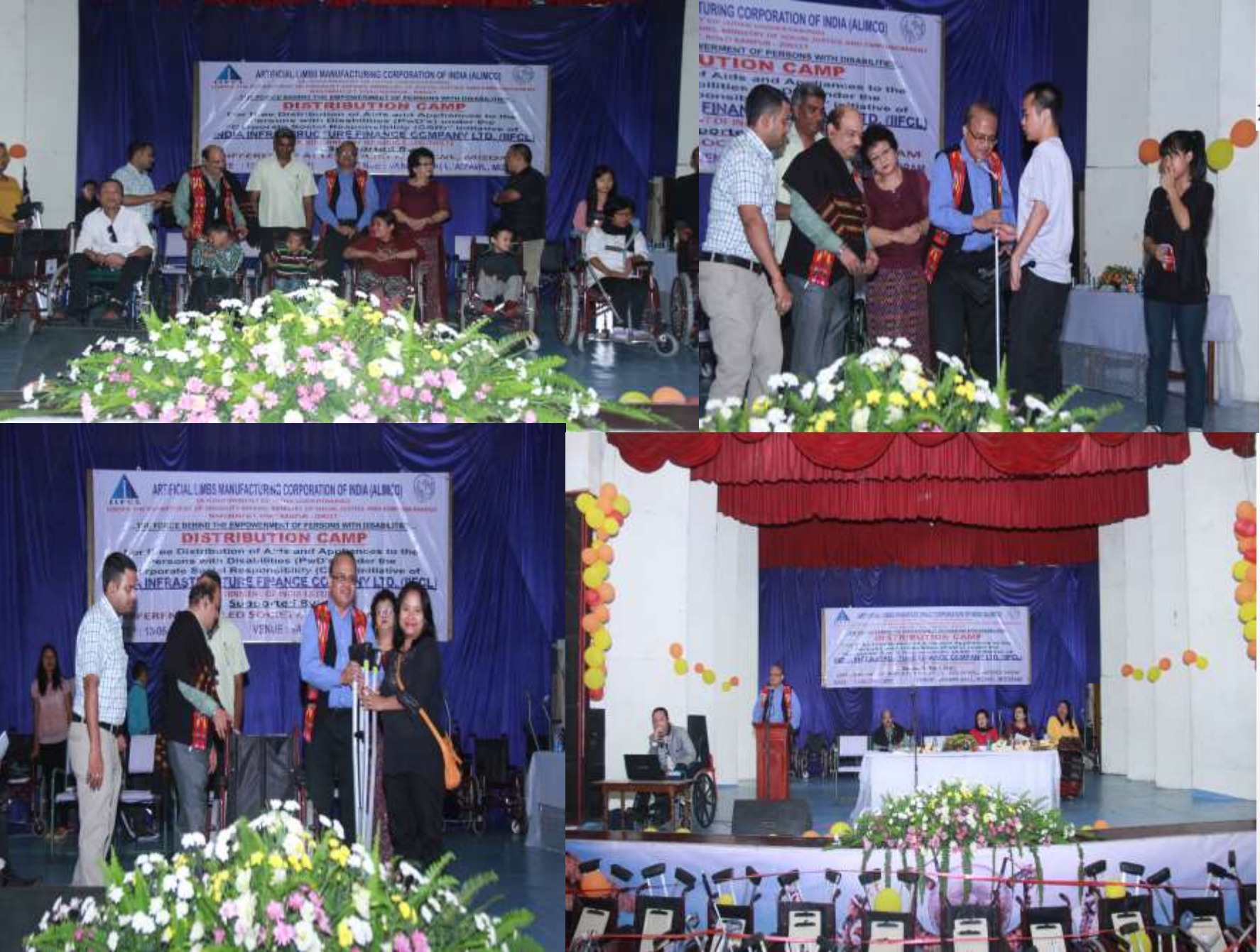
Distribution camp at Aizawl (Mizoram)