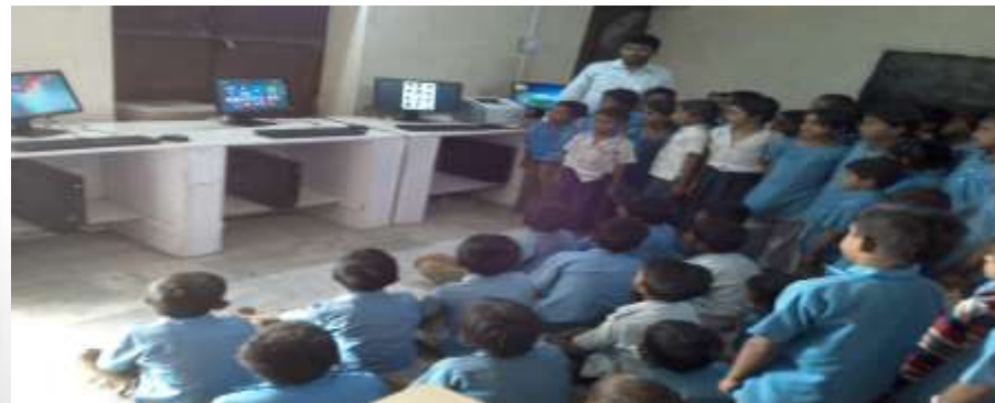
Solar Powered Enabled Computer Systems at the Government Upper Primary School