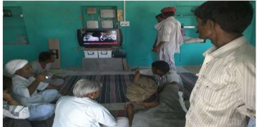
Elders at the Padampura (Jaisalmer) Community Center (Solar Powered)