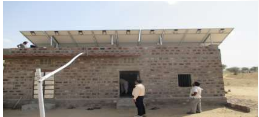
Solar Powered RO Water Plant at Padampura (Jaisalmer)