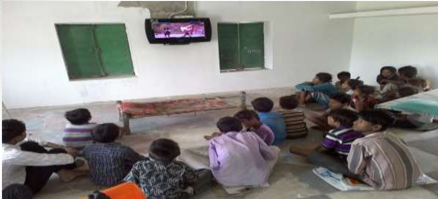
Children at the Manasar (Jaisalmer) Community Center (Solar Powered)