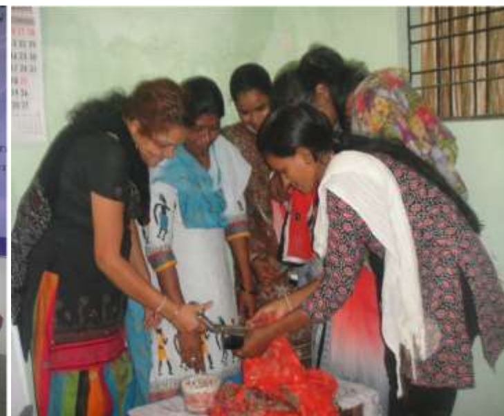
Candidates undergoing training in cloth designing trade