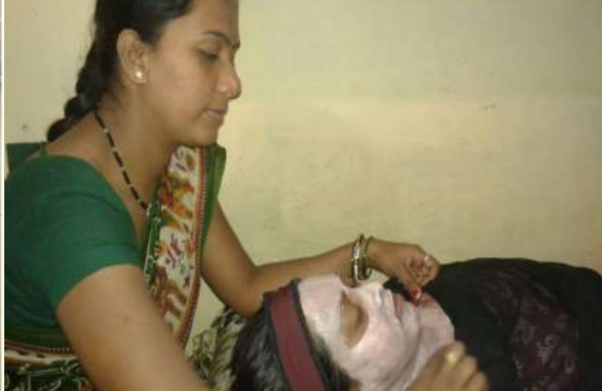
Candidates undergoing training in beautician trade