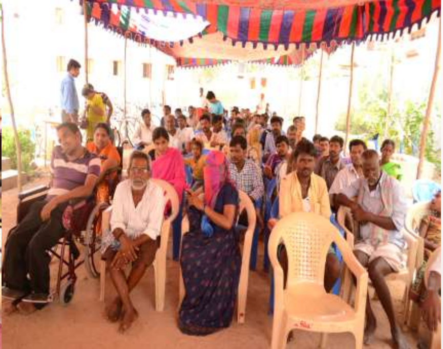
Distribution camp at Mehaboobnagar (Telangana)