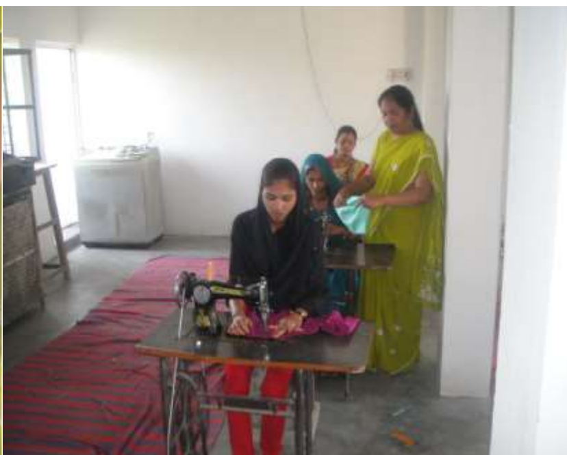
Candidates undergoing training in tailoring trade