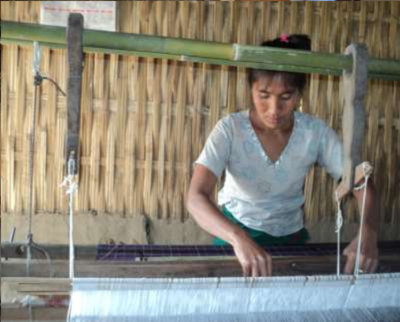
Candidates during the Training